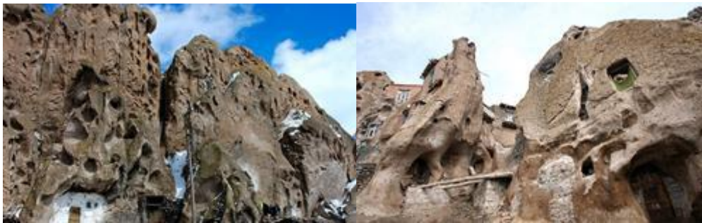
Image No. 6: Kandovan, a sample of the karans ( Karami & Sharifi, 2017)

During thousands of years lavas are mutated out from the volcanic peaks of Sahand mount and the other volcanoes. These lavas are accumulated during the centuries and as time has passed a tuff stone layer is created in different layers. Tuffs and the lavas have changed in form by the wind, rain and snow during the thousands of the years and are changed into bounds and gradually the low resistant and less hard parts of it are gone and the current situation which resembles a miracle is created.