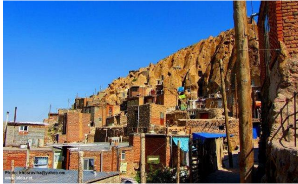
Image No. 12: Combination of the rocky architecture with the modern structures

1- The current new structures which lack harmony beside the exclusive rocky architecture, the limitless interferences which are not pre-programmed in cultural heritage organization not only encroaches the urban heritage, original textures and the exclusive rural and native texture but also go through elimination of these not returnable deposits (Masoud and Beigzadeh Shahraki, 2012).