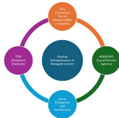
Figure 1: Stakeholders Engaged

technology demonstration in one of sewing enterprise households was a success which received well acceptance followed by increased demand from local sewing enterprises for the replication of solar units across their operations. Around 50 enterprises expressed their interest for adopting such solar systems, committing to contribute 50% of the installation costs by