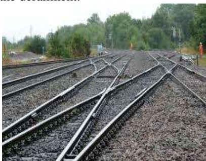
Fig 1. Railway Track

Rail track is one of the most important infrastructures for the rail transport and plays a vital role for the safe and comfort journey of the passengers. Monitoring of railway tracks routinely is essential in ensuring the safety of railway system. Poor track management leads to degradation in the quality of ride, flange contact, flange climb, finally leads to the derailment.