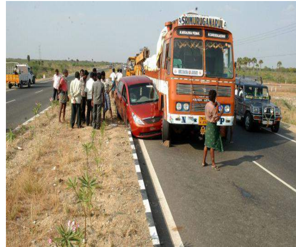
Figure 3 shows that a road accident is caused by the bad attitude of the driver where he cannot keep the lane discipline on road.