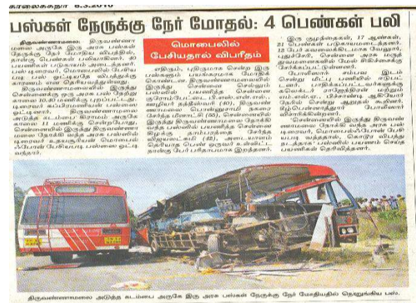
Figure 1. Bus accident caused by usage of mobile phone while driving

Figure 1 shows the photographic evidence of an accident caused by the misuse of cell phone while driving by the driver. Usage of mobile phone causes accident with buses face to face which caused 40 major injuries and four fatal accidents.