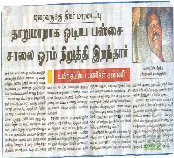
Figure 4 shows that the awareness for driver to react during emergency which has saved lives of 50 passengers. He stopped the bus when he felt that he is going to get a heart attack and saved lives of the passengers.