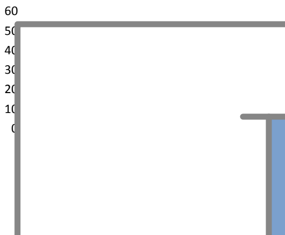
Figure 2. Driver type

Figure 2 shows that many of non professional drivers are involved in reckless driving. The certain number of cognitive skills and on their depends automation level and mainly drivers expertise. The professional driving between non professional drivers is clearly shown [16].