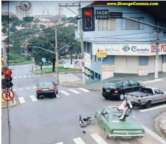
Figure 2 show that a vehicle accident due to over speed and ignorance of traffic signal causes a fatal accident.