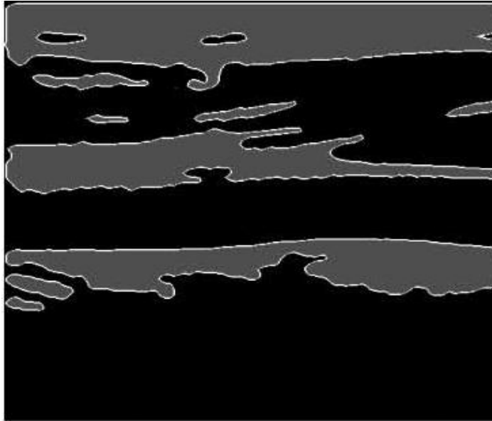
Figure 3: ROI detection: blood (in black) and the arterial tissue (in gray).

To filter the ROI, through the image with a square mask of size w \times w centered at every pixel in the ROI. Using VMF, every pixel under analysis will be replaced with the pixel from its neighborhood w \times w that returns the minimum Euclidian distance to all other pixels in the neighborhood as follows,